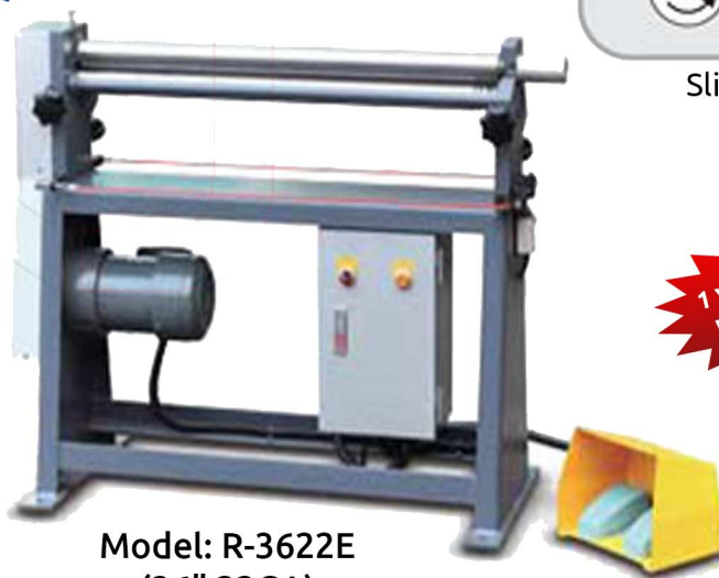
Model: R-3622E (36" 22GA)