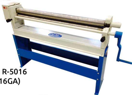
Model: R-5016 (50" 16GA)