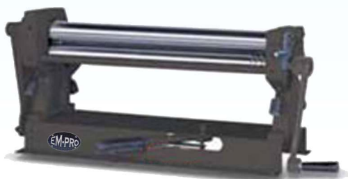
Model: R-2420 (24" 20GA)