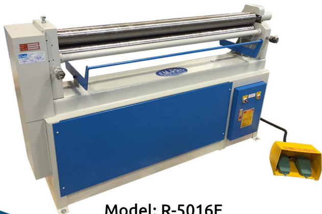
Model: R-5016E (50" 16GA)